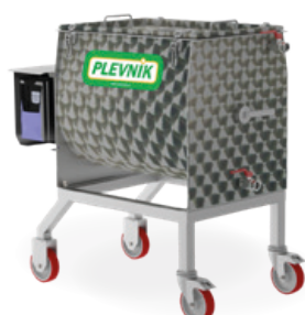
Support on wheels